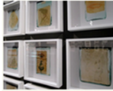
Katarzyna Minczak, The Special Signs, 2010, at Frank Fine Art, London, at the AIPAD Photography Show 2011

At first glance, the gray-carpeted grid of booths at the Park Avenue Armory , filled to the brim with photos both black-and-white and color (a few even move, digitally), is not all that exciting. Photography by definition mirrors the physical world, and it's easy to fill your eyes with the familiar.